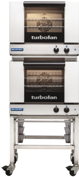
Model E22M3/2C shown

Double Stacked on a Stainless Steel Base Stand