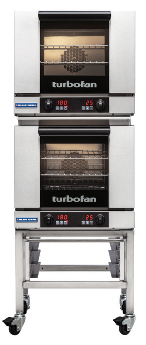
Model E23D3/2C shown

Half Size Digital / Electric Convection Ovens Double Stacked on a Stainless Steel Base Stand