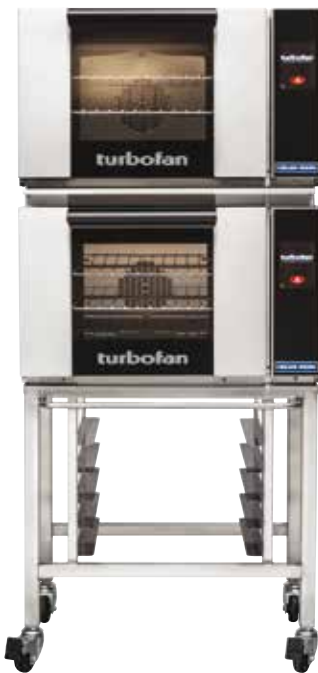
Model E23T3/2C shown

Half Size Electric Convection Ovens TOUCH SCREEN CONTROL Double Stacked on a Stainless Steel Base Stand