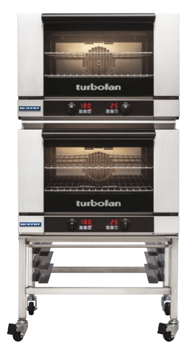
Model E27D2/2C shown

Full Size Digital / Electric Convection Ovens Double Stacked on a Stainless Steel Base Stand