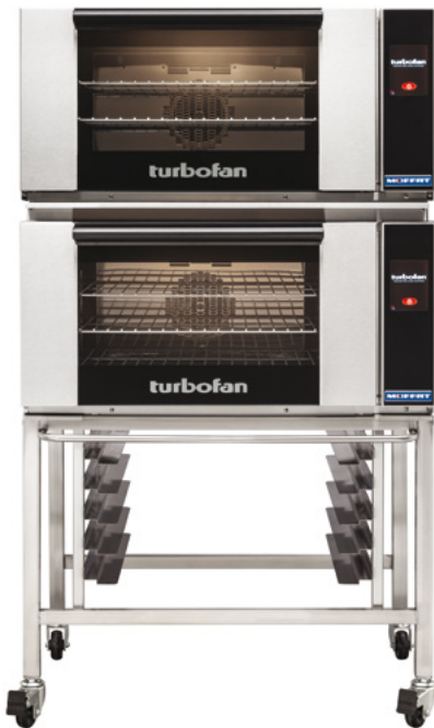
Model E27T3/2C shown

Full Size Electric Convection Ovens TOUCH SCREEN CONTROL Double Stacked on a Stainless Steel Base Stand