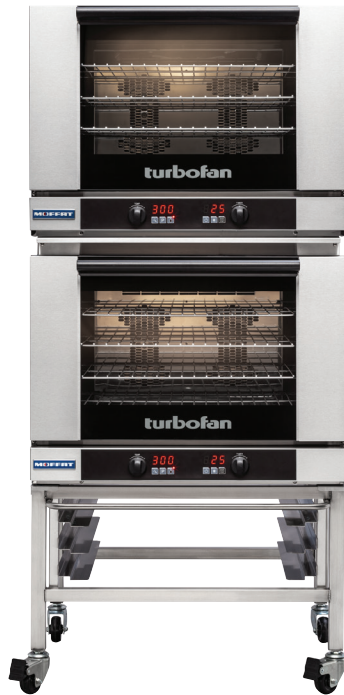
Model E28D4/2C shown

Double Stacked on a Stainless Steel Base Stand