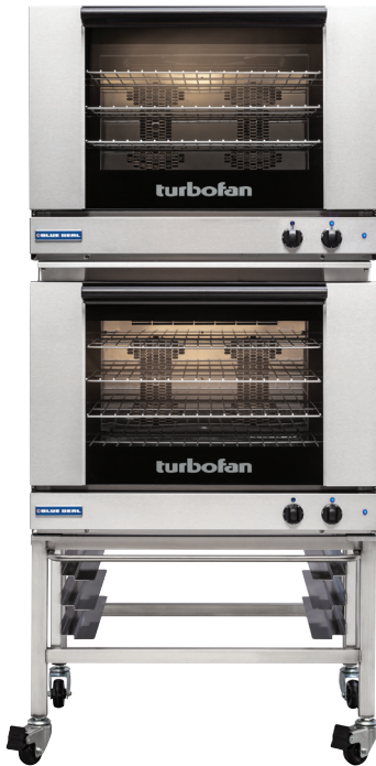
Model E28M4/2C shown

Double Stacked on a Stainless Steel Base Stand