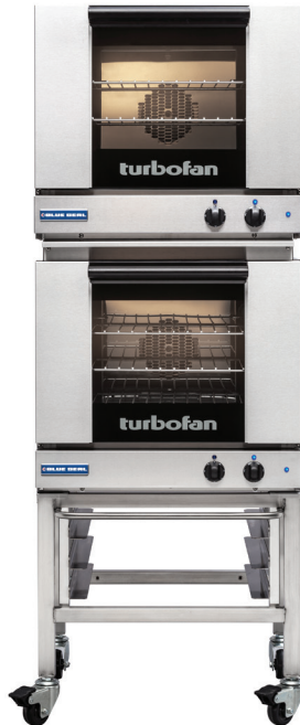
Model E23M3/2C shown

Double Stacked on a Stainless Steel Base Stand