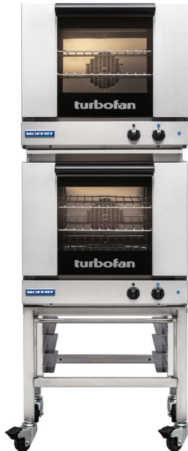
Model E23M3/2C shown

Double Stacked on a Stainless Steel Base Stand