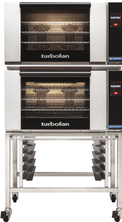
Model E28T4/2C shown

Full Size Electric Convection Ovens TOUCH SCREEN CONTROL Double Stacked on a Stainless Steel Base Stand