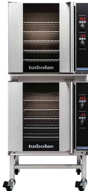
Model E32D5/2C shown