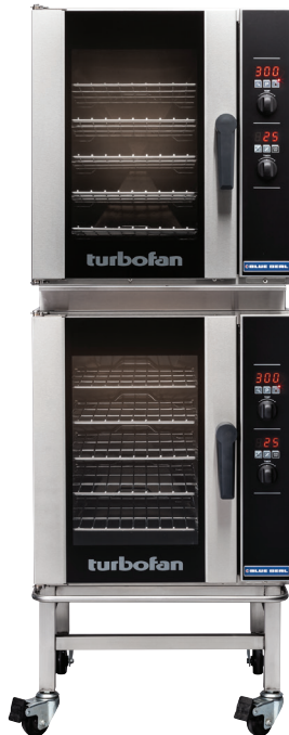
Model E33D5/2C shown