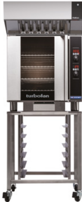
VH32 / E32D4 / SK32