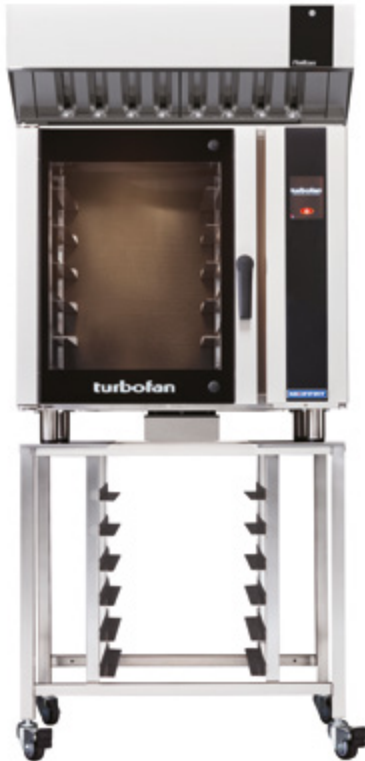
VH35 / E35T6 / SK35

Compatible with E35D6 / E35T6 convection ovens