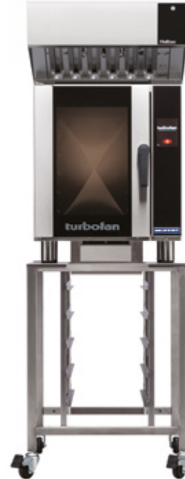
VH33 / E33T5 / SK33-VH