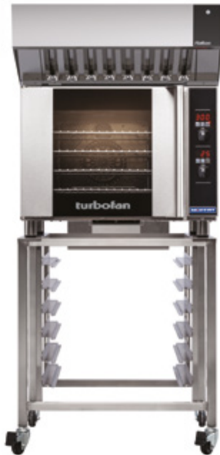
VH31 / E31D4 / SK2731N